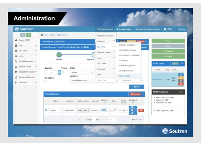
Administration pages for archive staff

The Archivist / Records Manager is in control of every aspect of the system through the use of simple menu selections. There are no external files to manage and no settings to be maintained on individual PCs. Soutron has easy to configure fields, data structures, record templates, classifications, thesaurus terms, locations and policies. Multiple Search Portals can be set up with secured content delivered as needed.