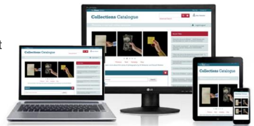
Designed for Desktop, Tablet & Mobile

Single or multiple search portals are easily created to cater for the information needs of discrete user communities. The library is able to direct content to the customers that it serves and present web pages with appropriate content and links to internal or external resources.