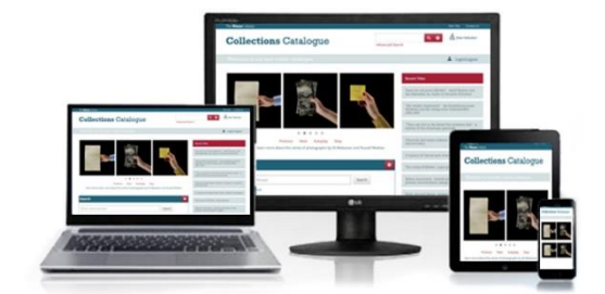
Designed for Desktop, Tablet & Mobile

The Archivist is in control of every aspect of the system through the use of simple menu selections. There are no external files to manage and no settings to be maintained on individual PCs. Soutron has easy to configure fields, data structures, record templates, classifications, thesaurus terms, locations and policies. Multiple Search Portals can be set up with secured content delivered as needed.