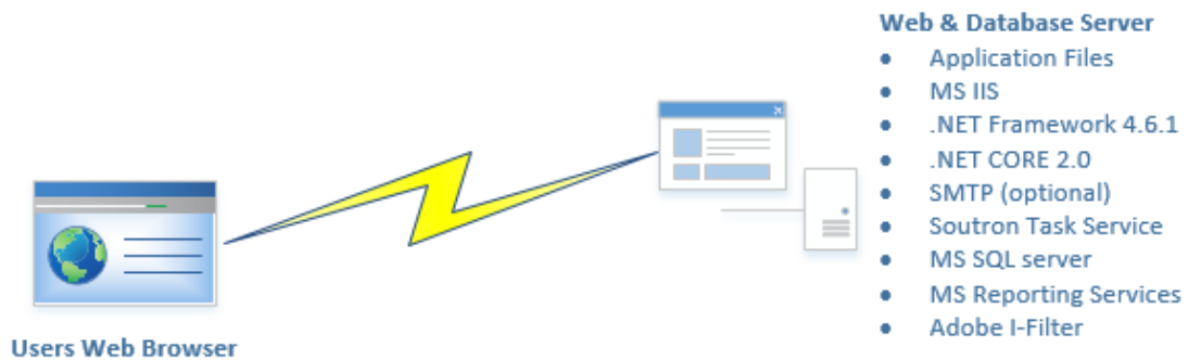
Diagram 2: Single server for database and website