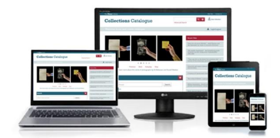
Designed for Desktop, Tablet & Mobile

The Archivist is in control of every aspect of the system through the use of simple menu selections. There are no external files to manage and no settings to be maintained on individual PCs. Soutron has easy to configure fields, data structures, record templates, classifications, thesaurus terms, locations and policies. Multiple Search Portals can be set up with secured content delivered as needed.