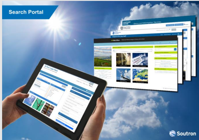
Search Portal for end user access