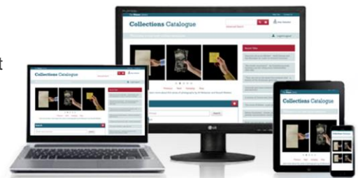
Designed for Desktop, Tablet & Mobile

Single or multiple search portals are easily created to cater for the information needs of discrete user communities. The library is able to direct content to the customers that it serves and present web pages with appropriate content and links to internal or external resources.