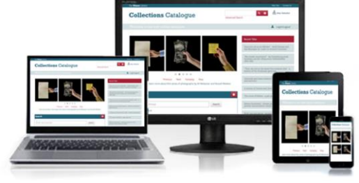
Designed for Desktop, Tablet & Mobile

Single or multiple search portals are easily created to cater for the information needs of discrete user communities. Staff are able to direct content to the customers that it serves and present web pages with appropriate content and links to internal or external resources.