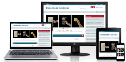
Designed for Desktop, Tablet & Mobile

Single or multiple search portals are easily created to cater for the information needs of discrete user communities. Staff are able to direct content to the customers that it serves and present web pages with appropriate content and links to internal or external resources.