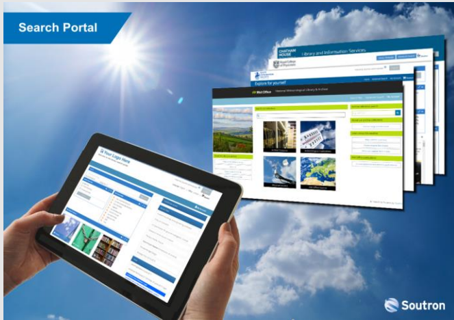
Search Portal for end user patron access